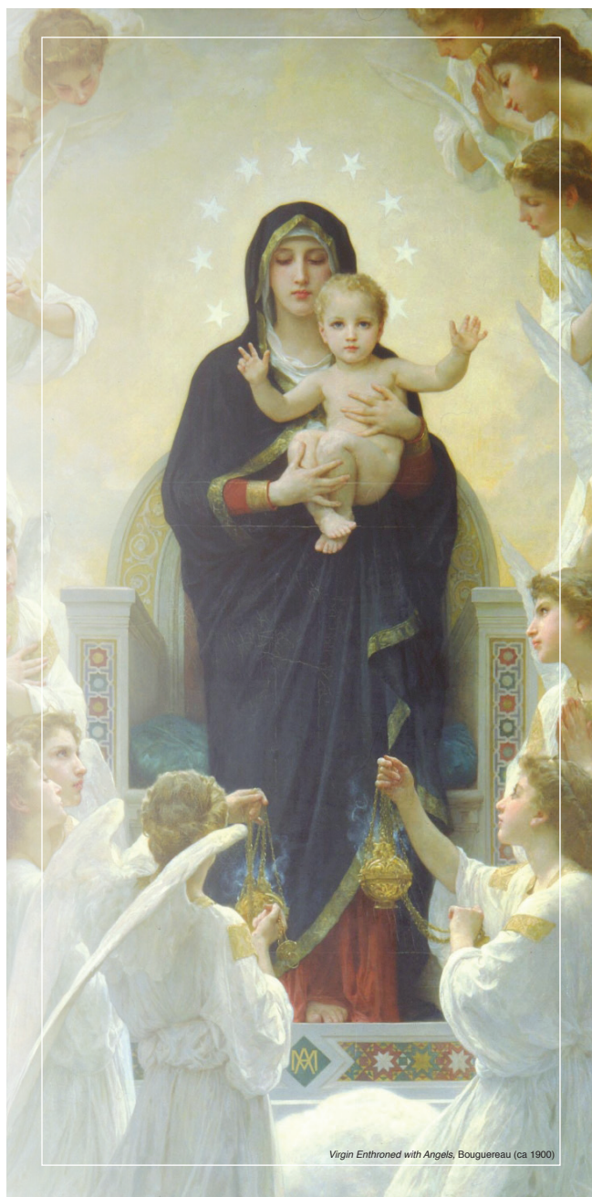
Virgin Enthroned with Angels, Bouguereau (ca 1900)